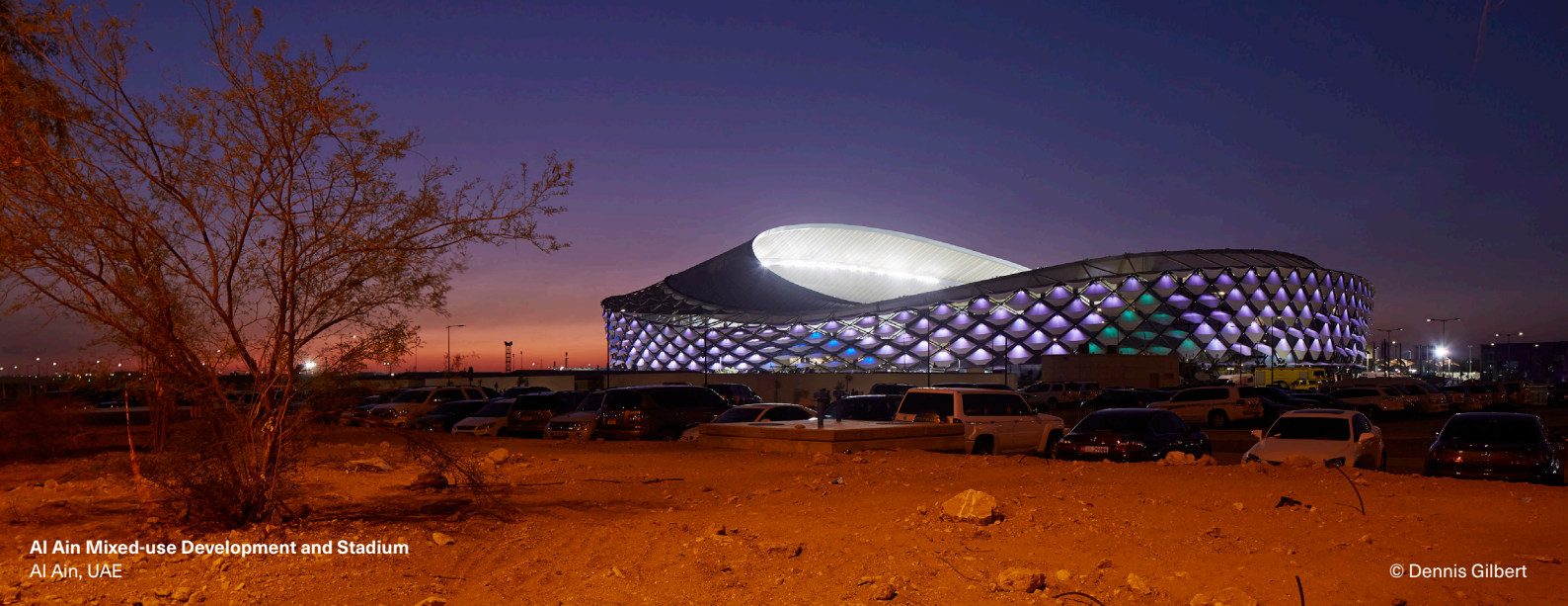
Al Ain Mixed-use Development and Stadium Al Ain, UAE