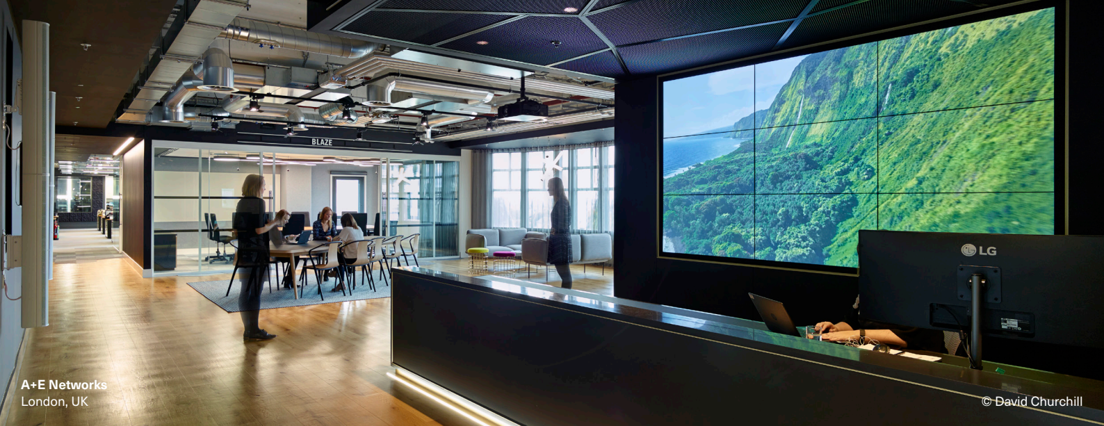
A+E Networks London, UK